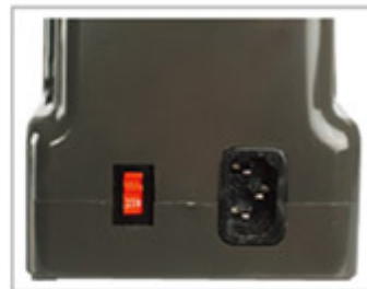
AC 110/220V switch