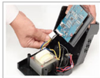
Modular design for easy repair(only for SS-207)